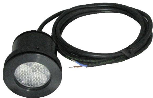
Panel LED spot.