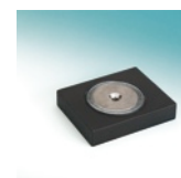
Magnetic plate B01